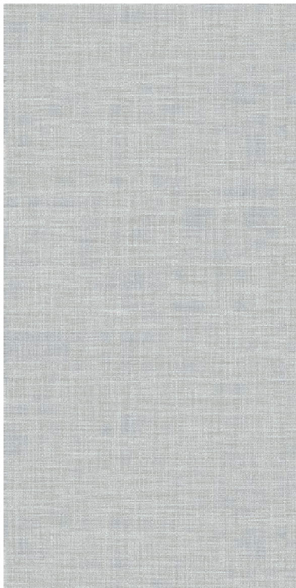
30 x 60 cm (12 x 24) Matte Finish JZ.LN.LGR.1224.MT