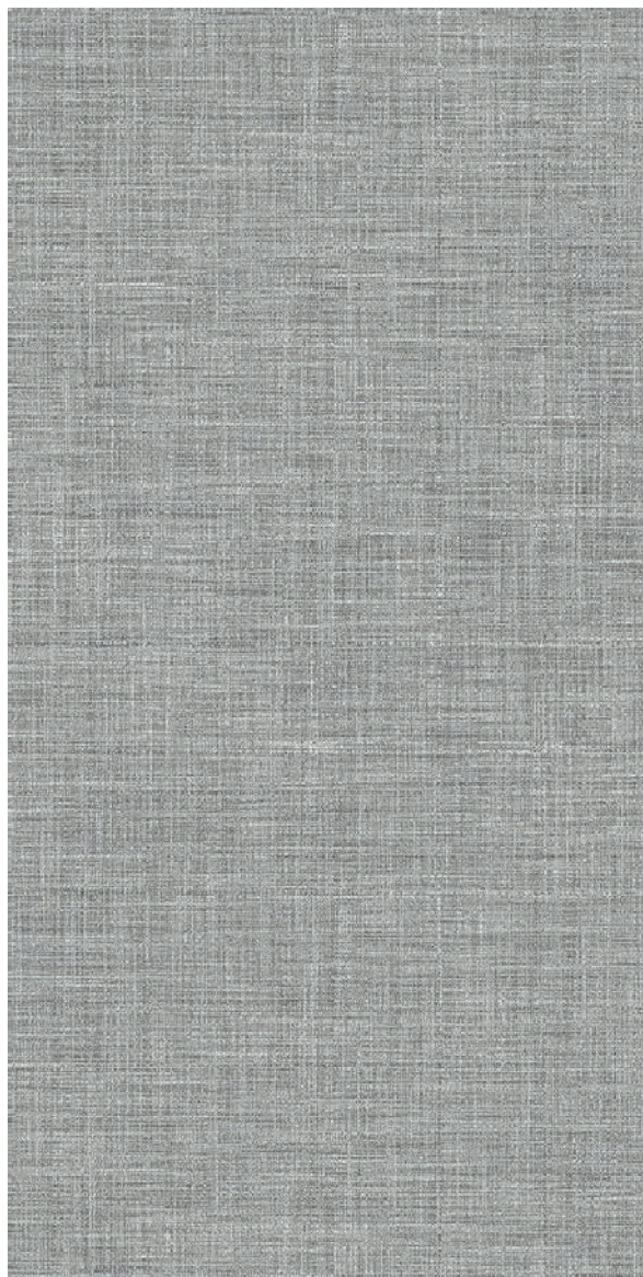
30 x 60 cm (12 x 24) Matte Finish JZ.LN.DGR.1224.MT

All items shown in this document are part of Olympia's stocking program. For special orders, please contact your Olympia Tile Sales Representative.